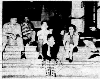
PRACTICING —Members of the cast for "Bull in a China Shop" have a line rehearsal while other students work in preparation for performance in Breck auditorium Thursday and Friday, May 12 and 13.