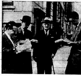
DAPPER BABY SITTER . . . Former President Harry S. Truman took a short visit here Friday during his regular morning stroll. He is Goddard baby-sitting with his grandchildren while his daughter and her husband tour Europe.