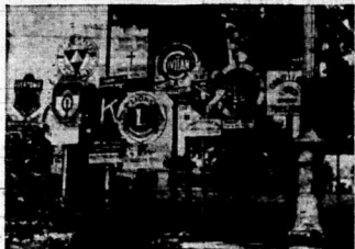
JUST JOINERS... Residents and Clearwater, Fla., offer help and friendship to nine million visitors each year through these organization emblems at the edge of town.

Visitors from out-of-state bringing boats into Kentucky will be allowed to operate them for 90 days without registration, if the boats already have registration numbers from other states or federal-issued numbers.