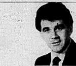
Morehead State University Morehead, Ky.