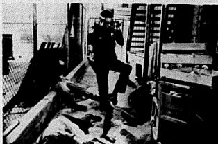
Dr. Monsignor Larvelle Jones (Michael Winslow) displays his karate talents as well as his vocal visions.