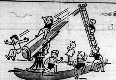
ANTI-AIRCRAFT GUNS FOR PLAYGROUND SLIDES