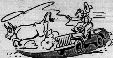
LEAPING JEEPS FOR WILD WEST RODEOS