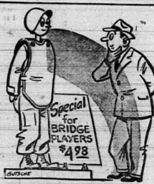
COMBAT EQUIPMENT FOR BRIDGE PARTIES

But there's ONE THING you don't have to reconvert!