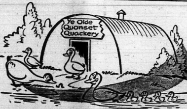
QUONSET HUTS FOR HOUSING DUCKS