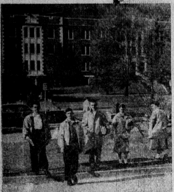
NEW CROSSWALK—Taking advantage of the new crosswalk to the Doran Student House are a number of Morehead State College students. Signs have been erected which make it mandatory for automobiles to stop when pedestrians are near the crosswalks. (See editorial on page two.)

The ticket sale will be offered to area high schools. The ticket sale will be offered to area high schools.