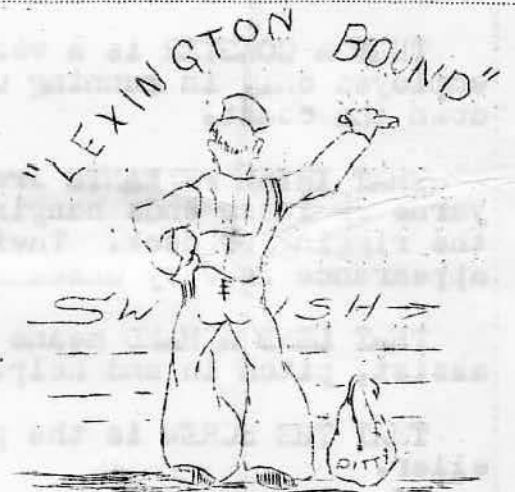
5-MINUTES AFTER GANGWAY