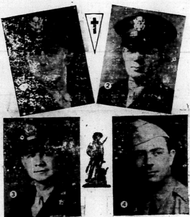
The four United States Army Chaplains who gave their lives so that women of the Army Transport Service might live to carry on are shown here. 1. Rev. Clark V. Poling; 2. Father John F. Washington; 3. Rev. George L. Poe; 4. Rabbi Alexander D. Good.