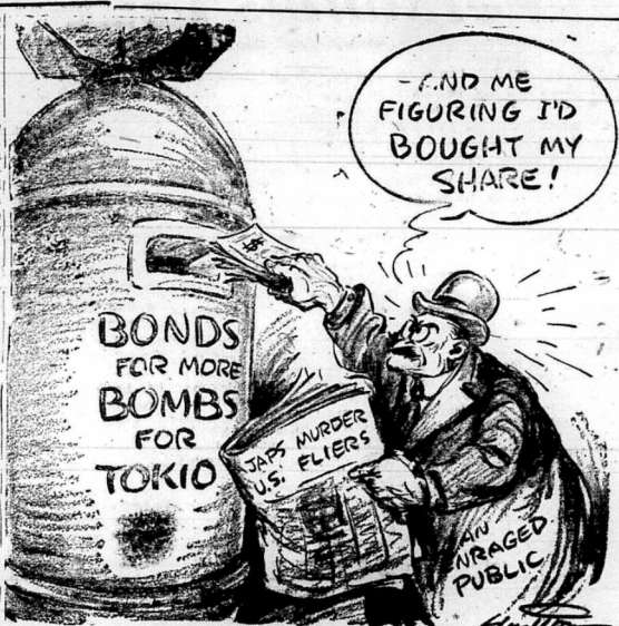
WE CAN DO SOMETHING ABOUT IT!

The success of the North African venture was largely due to the fact that it came as a sur-