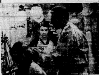
THE NAVY DENTAL OFFICER pictured above is working on the teeth of an enlisted man in the ship's dental office aboard the U.S.S. Salt Lake City, 10,000-ton cruiser.

Included among the fifty-old trade and vocational training courses open to recruits in the U. S. Navy or Naval Reserve who pass the required examination is dental technician schooling. This course, like all Navy trade and vocational courses, is free and provides an excellent groundwork for a future career in later civilian life. All recruits receive their regular Navy pay during the period they are at a Navy trade school. This training is valued at hundreds of dollars.