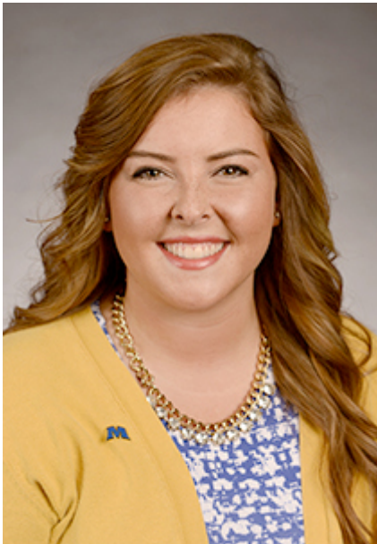
Reno (Rennie) Davis