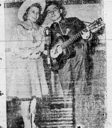
At College, March 10, At 7:00