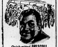
Quick-witted DRISCOLL, brilliantly played by Thomas Mitchell, Academy Award winner.

LOADED WITH DYNAMITE! This mighty drama of the sea... a story of primitive human joys and hatreds as only Eugene O'Neill could write it!