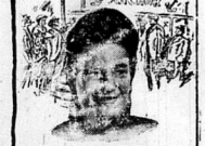
Simple-hearted OLEY, who was going home of (John Wayne's finest role).

Walter Wanger presents JOHN FORD'S Production of EUGENE O'NEILL'S