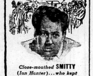
Close-mouthed SMITTY (Ian Hunter)... who kept his tongue to himself.