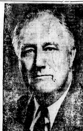
PRESIDENT FRANKLIN D. ROOSEVELT