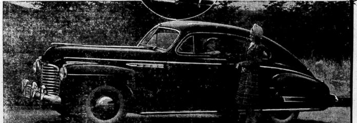
Buick SPECIAL 6-passenger Sedan, $1006 delivered at Flint, Mich. Wheel shields and white sidewall tires, extra.*

The reason is not alone the grace of its Buick-created lines, nor the appearance of solid substance in action that gives this honey the look of a speedster straining at its leash.