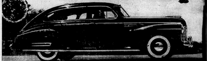
Buick SPECIAL 6-passenger 4-door Sedan, $1052 delivered at Flint, Mich. Wheel shields and white sidewall tires, extra.*

AS surely as the new Buick FIREBALL straight-eight engine sets the performance pace for the coming season, the graceful silhouette of the new Buick SPECIAL and CENTURY cuts the automotive style pattern for another half decade.