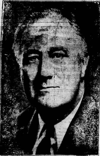
PRESIDENT FRANKLIN D. ROOSEVELT