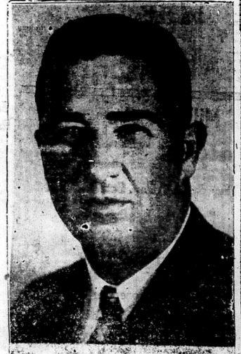
SENATOR A. B. "Happy" CHANDLER

This Is a Small Measure of Roosevelt's Service To Our People: