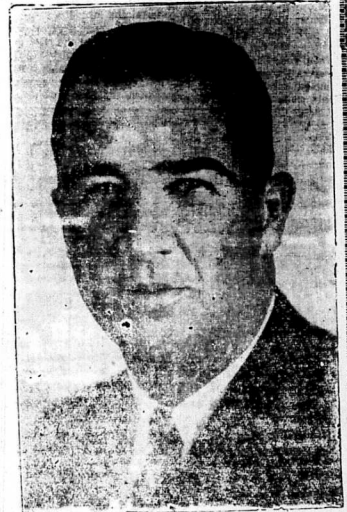
SENATOR A. B. "Happy" CHANDLER