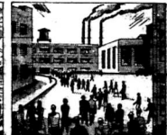
2. But today, with so many industries producing equipment for the Navy, the "E" has been awarded to a few factories, too.