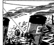
1. The "E" is the highest group honor awarded by the Navy. Crews work hard for it, and are proud to see it on their vessel.

It is the U.S. Navy "E." This symbol, on a Navy vessel, indicates special "excellence" in some activity such as gunnery or engineering.