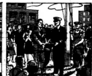
4. The "E" flag was hoisted September 19, and hundreds of Erie G-E employees are proudly wearing "E" buttons to show that they, too, share the honor.

General Electric believes that its first duty as a good citizen is to be a good soldier. General Electric Company, Schenectady, N. Y.