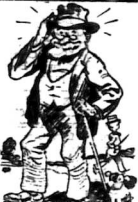
PROSPERING IN CHATSWORTH MEANS A SWELLING OF THE ACCOUNTS IN THE BANK.

Your bank account will improve the thrifty prices of our dependable used cars. Enjoy miles of satisfaction in a good-looking car plus economy.