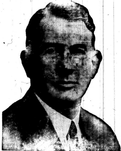
SENATOR ALBEN W. BARKLEY

Voters of Rowan County and this section of Kentucky will have the opportunity to hear Senator Alben W. Barkley speak when he delivers an address at the courthouse in Morehead, Thursday afternoon, starting at 1 o'clock.