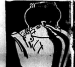
TEA KETTLE 12 cards & up