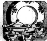
34-PIECE SET DISHES 50 cards & up