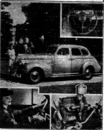
Three series of passenger cars, re-designed in the new "Royal

Clipper" styling, and embodying numerous mechanical improvements to assure greater safety and performance comprise Chevrolet's comfort as well as finer stream-line for 1940, introduced today. All series are much larger, overall strength being increased 4 3/4 inches. The new exclusive vacuum power shift (lower left) is now regular equipment on all models of all series at no extra cost. Special DeLuxe series, the Sport Sedan of which is shown at center, has a new T-spoke steering wheel with horn-blowing ring (upper right). Lower right, the 1940 Chevrolet six-cylinder valve-in-head engine, which has been improved for smoother, quieter operation, and extremely long life.