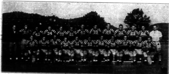
Reading from left to right:

Mentho-Mulsion is endorsed by your neighbors and guaranteed by leading druggists everywhere—adv.