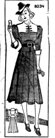
Designed for sizes 12, 14, 16, 18 and 20. Size 14 requires 5 yards of fabric. Make with wide bias to contrast for collar and cuffs.

ged. The river has 'ntrenched itself in a winding course in the Cum berland plateau to a depth of four hundred feet above the Falls. It plunges in wild and splendid beauty about sixty feet over a sandstone ledge. Below the Falls is developed a deep gorge, narrow, boulder-choked, and tortuous in figure. The Park, a gift of Senator Coleman Dupont of Kentucky, has been developed into a glorious recreational area of restful natural beauty and ruggedness.