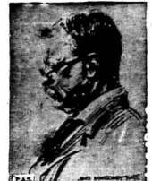
He Slept With a Loaded Revolver Beside His Pillow in the White House

He died peacefully in his sleep on January 4, 1919. The last words he ever uttered were: "Please put out the lights."