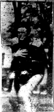
ASHLAND High School