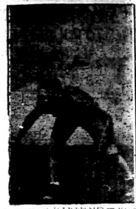
155 — Jr. Ashland High School