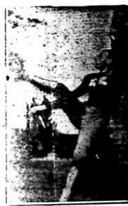
SON FAIR — RB — Conway Ark.