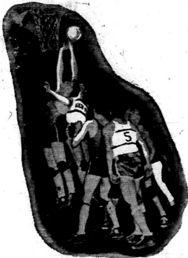
GET YOUR ENTRS IN AT ONCE SPEED COUNTS

sent to the District Superiors to facilitate delivery when thousands of people were in temporary quarters. Every means of conveyance has been used in getting these checks to the recipients, many through necessity, being delivered by boat. FOR SALE New and attractive house on Bays Ave. Can arrange terms. See, H. Vantwerp. CITIZENS BANK.