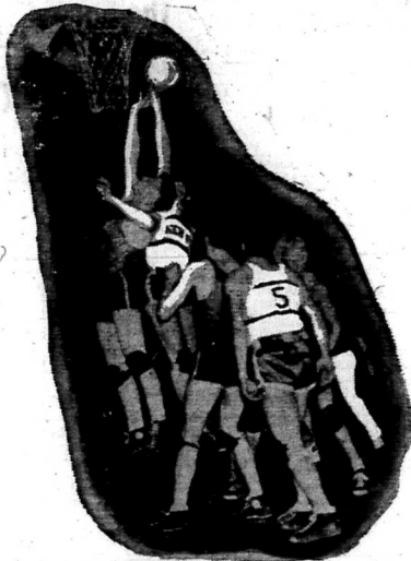
GET YOUR ENTRIES IN AT ONCE SPEED COUNTS