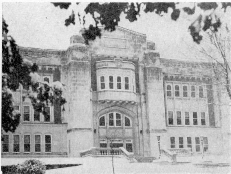
Johnson Camden Library