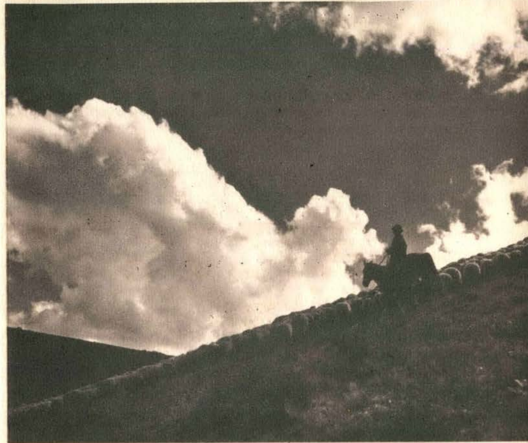
A Shepherd's Care

The Imitation of Christ by Thomas à Kempis