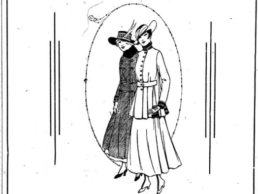
Autumn 1917 fashions are fittingly forecasted in the early season styles which are now attracting the early choosers who establish local leadership by right of first choice of the accepted styles for the new season.