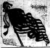
TEACH THEM ENGLISH.

An official bulletin of the Bureau of Education asserts that there are 3,000,000 foreign-born white residents of the United States who cannot speak English. The total of foreign-born whites is about 15,000,000. There is a manifest need for the Americanization movement. By every practical means the government and the people of the United States should provide opportunity for the non-English immigrant to learn the language spoken in this country.