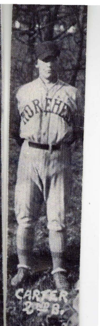
CARTER 2 ND B.