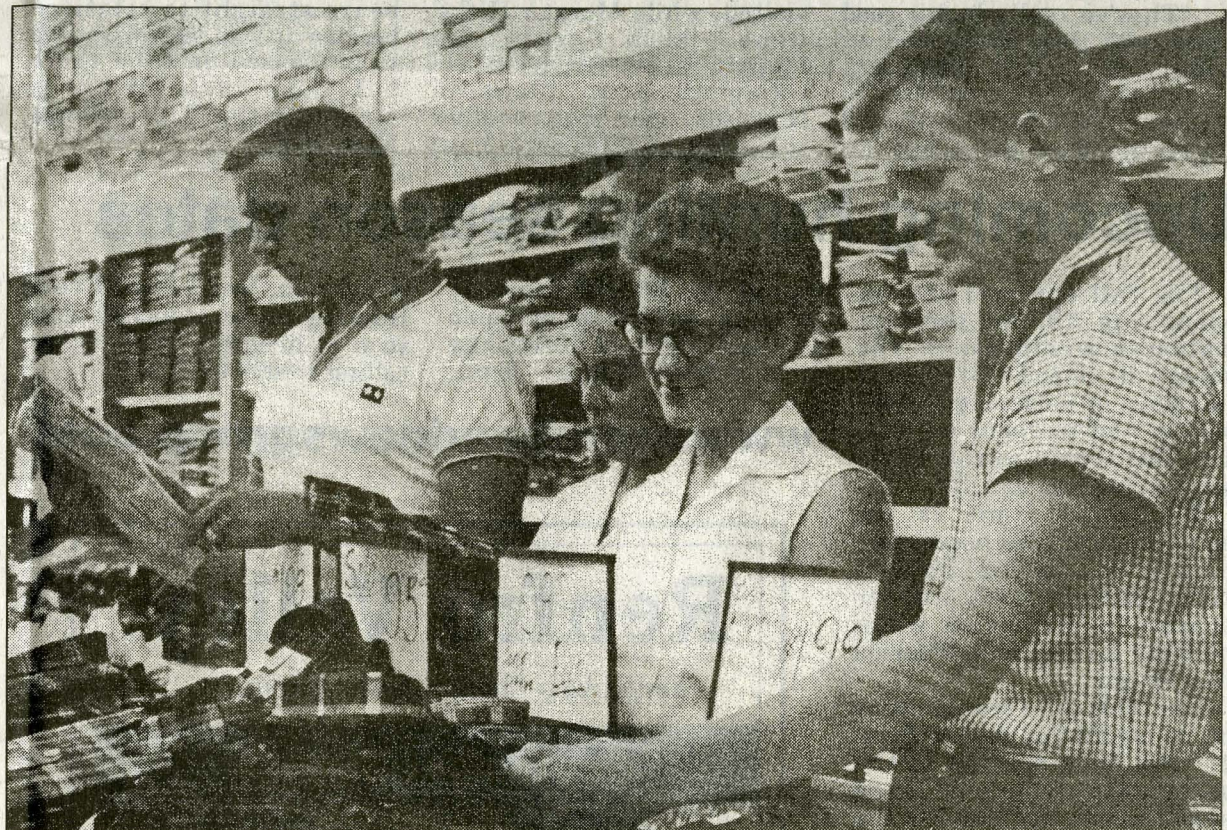
Customers look through Martin's sale items at the old store in the 1950s.

have to keep up on the latest styles and trends. Your stock must be fresh to be able to keep up with the trends.