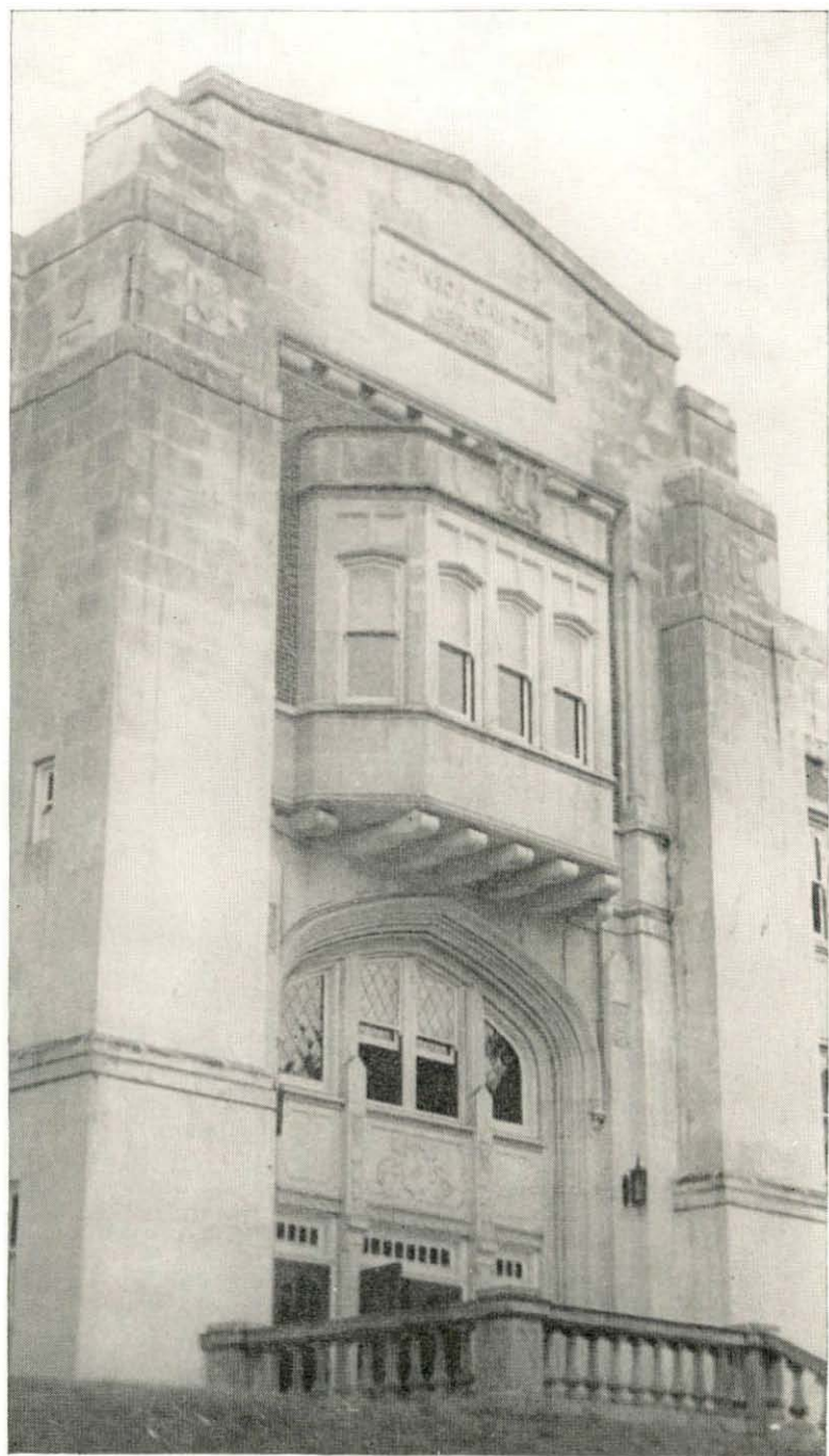
ENTRANCE JOHNSON CAMDEN LIBRARY