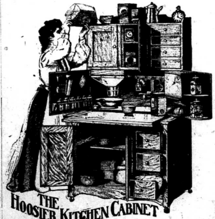
THE HOOSIER KITCHEN CABINET

We have on display a complete line of Hoosier Kitchen Cabinets. Come and see how splendidly they are built with due regards for convenience, how reasonable the price and how much work they save.