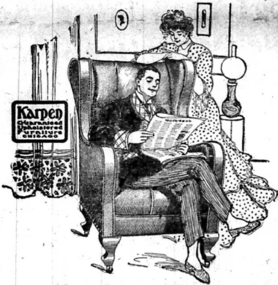
The "KARPEN" Rockers

Our stock in this line is made up of the very best in both quality and rich and handsome design that could possibly be bought from Manufacturers and sold at prices ranging from $7.00 to $16.00