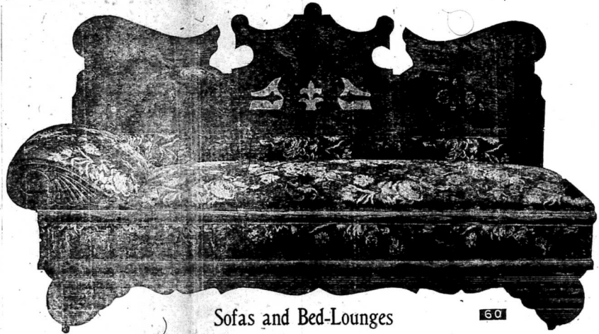
Sofas and Bed-Lounges