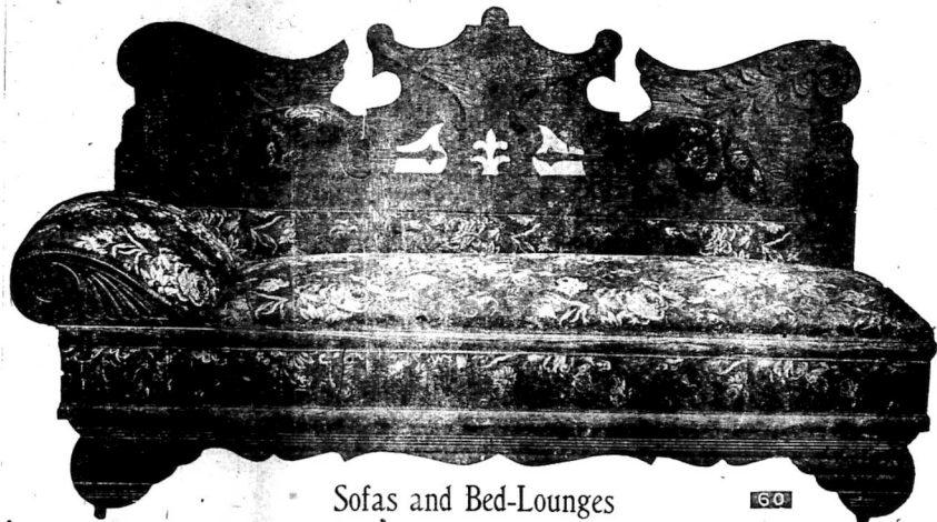
Sofas and Bed-Lounges