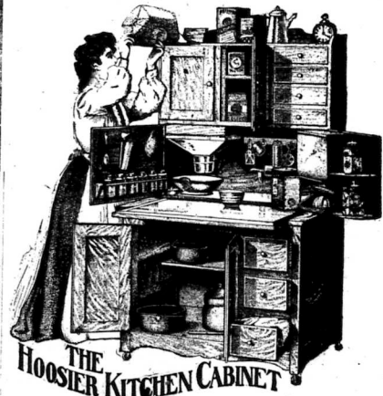
THE HOOSIER KITCHEN CABINET

We have on display a complete line of Hoosier Kitchen Cabinets. Come and see how splendidly they are built with due regards for convenience, how reasonable the price and how much work they save.