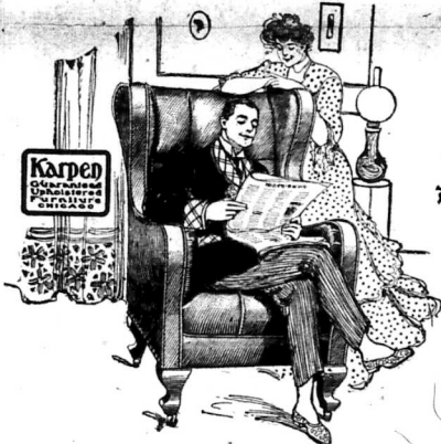
The "KARPEN" Rockers

Our stock in this line is made up of the very best in both quality and rich and handsome design that could possibly be bought from Manufacturers and sold at prices ranging from $7.00 to $16.00