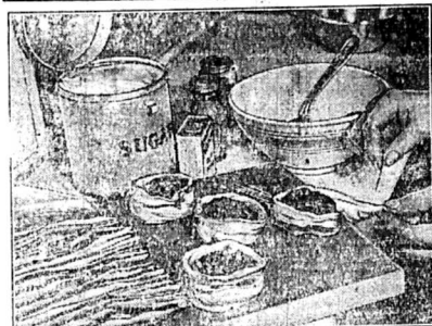
By Jane Rogers

In these days, when less expensive meat dishes are sometimes a necessity, one nevertheless wishes to preserve the attractiveness of the main course. For instance, hamburger steak, which contains the rich body-building properties of an expensive tenderloin, can be a dignified and delicious part of the menu. In the role of mock filet mignon, it is quite a different proposition from the plain meat ball, both in looks and in flavor. In preparing meats, especially the cheaper cuts which require more careful seasoning to make them tasty, good cooks find sugar as useful as salt and pepper in bringing out the full meat flavor. It is used in this recipe and heightens the mingled savor of beef and bacon. Mock Filet Mignon Mix 1 1/2 pounds of finely ground chuck or rump steak with one tablespoon ground nut, one teaspoon of salt, one teaspoon of sugar, 1/4 teaspoon of pepper and paprika to taste. Mix well; make into flat cakes one inch thick; twist a thin slice of bacon around each cake and fasten with a toothpick. Broil or pan broil 15 to 20 minutes. As the meat cooks, the bacon strips shrink and fit snugly around the cake, looking very much like the membrane which surrounds a real file.