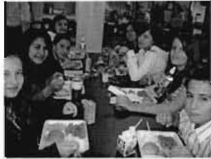
The group from Costa Rica enjoy lunch at McNabb Middle School during their visit to Morehead State and Montgomery County.