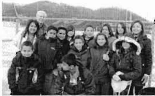
Costa Rican students enjoyed their visit to MSU.