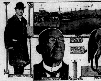
News Snapshots Of the Week