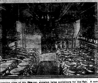
Interior view of the fish cage, showing large catfish for the fish-bait. A constant flow of fresh air is pumped into the cans through the rubber tubes which keeps the fish alive on long trips.

Bevers of Ointments for Corns that Contain Mercury A merciful will surely destroy the miser and covetous.