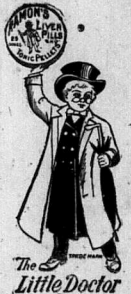
The Little Doctor

111 E. Main St., Lexington, Ky. 234 Fourth Ave., Louisville, Ky. or Union Depots.