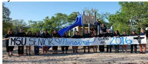
MSU BSN Class of 2016 Providing Community Service at Trooper Island

private schools, presented their research, participated in community service in conjunction with Camp Smile, Kentucky State Police Trooper Island, "Oh Baby it's a Baby Shower" sponsored in conjunction with UK Healthcare, AHEC, and St. Claire Regional Medical Center, March of Dimes Walk, and assisted in the continued relief efforts in Haiti in conjunction with Children's Lifeline International. We are so proud of our graduates, current students and faculty.