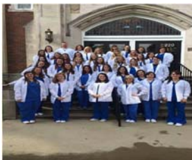
BSN Class of 2016

The BSN program has an unofficial NCLEX passage rate of 97% for the May 2016 graduates! The BSN program is very proud to offer quality programming for students from the service region and beyond. Our graduates are employed by area health care facilities and throughout the nation. We are very proud of our graduates and their contribution to the region.