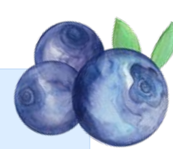
Low income families with hard access to fruits and vegetables