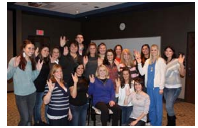
Congratulations Class of 2011!