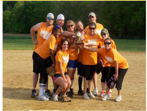
Spring 2012 Softball Team Champions

Any alumni interested in playing then contact Christa Bledsoe at cj.bledsoe@moreheadstate.edu .