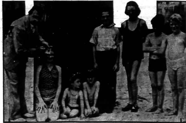
There was a hotly contested freckle tourney during the Sun-Sand-Surf festival at Long Beach, Calif., and the "freckle-meter" was used to determine who was the champion. It was a piece of cardboard with an inch-square hole through which the judges could make the count.