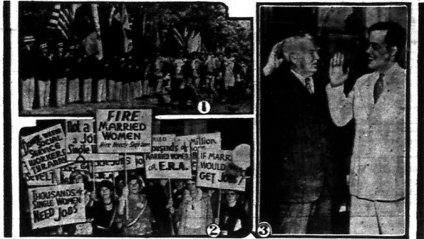
1-Flags of the thirteen original states carried as the Pennsylvania Sons of the Revolution dedicated at Valley Forge a replica of one of the huts occupied by Pennsylvania troops in the winter of 1777-78. 2-Single women of Boston peacefully picketing emergency relief headquarters. 3-Vice President Garner administering the oath to Rush D. Holt of West Virginia who took his seat in the senate on reaching the constitutional age of thirty years.