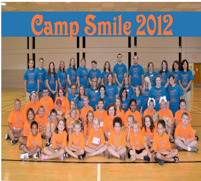
30 campers, 15 Nursing Students, 2 faculty