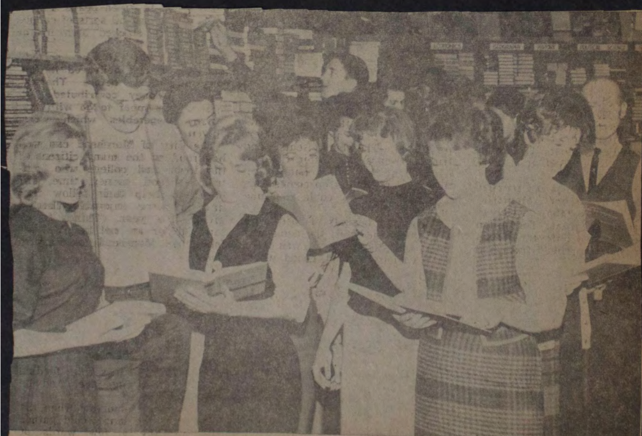
REGISTRATION RUSH —Members of the Student Council and the Council of Presidents show what a multitude of students invade the bookstore for textbooks each semester during registration.