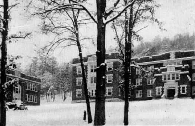
Left wing of Thompson Hall with end of Administration Building at left.