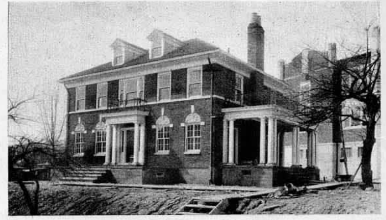
President's home, Morehead.

One of the "major objectives," as set forth by the National Education Association and other authorities, is health education. More stress is now placed upon this feature of modern education than ever before. More-