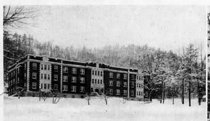
Fields Hall-dormitory for girls, Morehead.